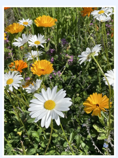
By Oliver Yr. 7