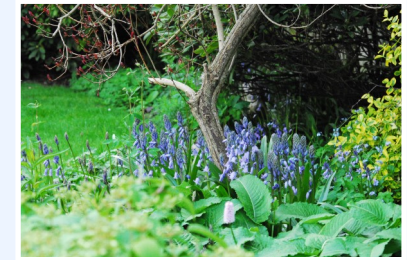
By George Yr. 9