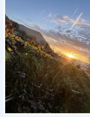
By Leon Yr. 11